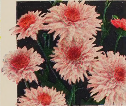
ORCHID HELEN. 60c each; 3 for $1.50